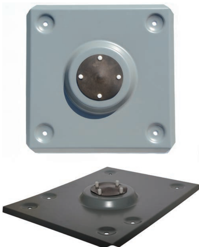
Supplied with sealing gasket

Two standard variants are available offering either 4 or 6 fixing holes, however some custom fit solutions are available. The 6 hole plate is to be used for end corners and ends, with the 4 hole plate used for intermediates only. For any queries do not hesitate to contact the Checkmate technical team.