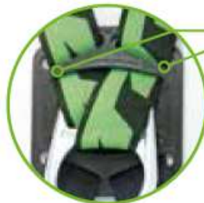
Fall indicators on the back plate for easy inspection