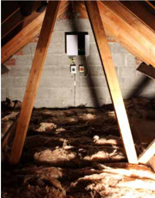
Fibreglass can hide many hazards.

When overlapping several 240 Mats, take care to ensure that no traps are created through which a person can fall; i.e. each mat must overlap onto the next joist