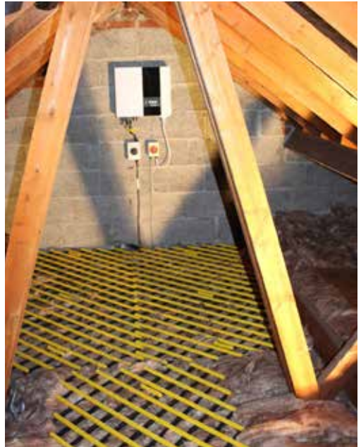
240 Mat eliminates many hazards.